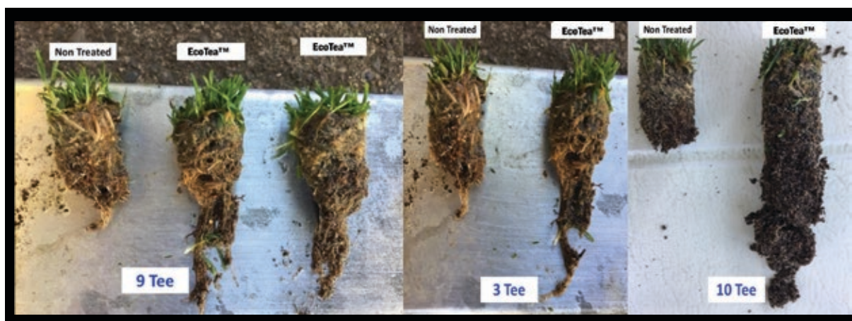
Uplands Golf Course, Victoria, BC. EcoTea™ application on a USGA spec green vs. a push up green.

Store unopened product in a cool dark environment. Do not let product freeze.